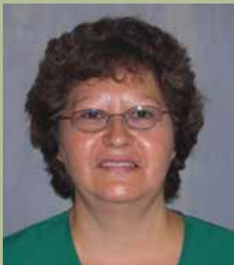
Grace C Aragon Environmental Services