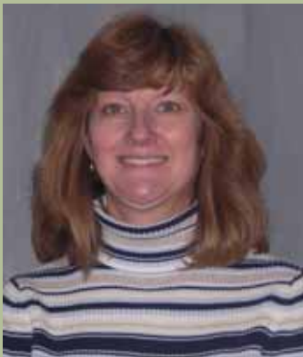
Gwendolyn Kahler Lab