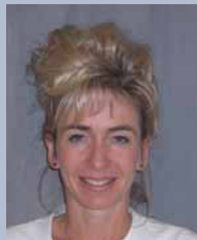
Kathleen M Wilson Procedure Center