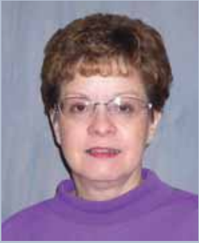
Pamela C Adler Lab